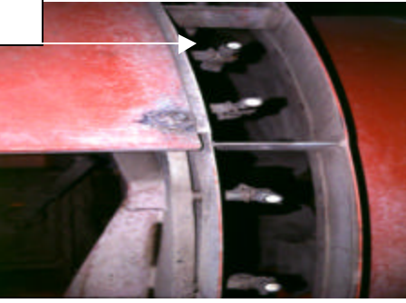
Figure 1b. Close-up of high-pressure nozzles in back of tank that sprayed the pesticide mixture up into the air