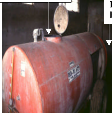
Figure 1a. Tank holding pesticide mixture

Pesticides and water added to tank through hatch